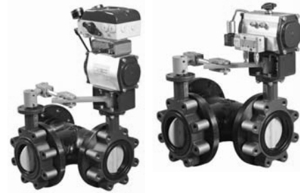
Three-Way, Industrial-Grade, Spring-Return, V-919x Series High-Pressure Pneumatically Actuated, Standard-Pressure, Standard-Temperature Butterfly Valve Assemblies

If the VF Series Butterfly Valve Assembly fails to operate within its specifications, refer to the VF Series Standard-Pressure, Standard-Temperature Butterfly Valves Product Bulletin (LIT-977205P) for a list of repair parts available.